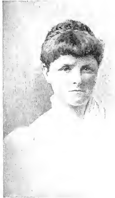
MARY E. WILKINS.